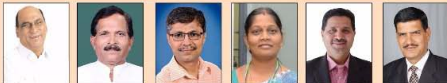
Hon'ble Shri Dattaji Meghe Chancellor, DMIMS (DU) Ex-member of Parliament