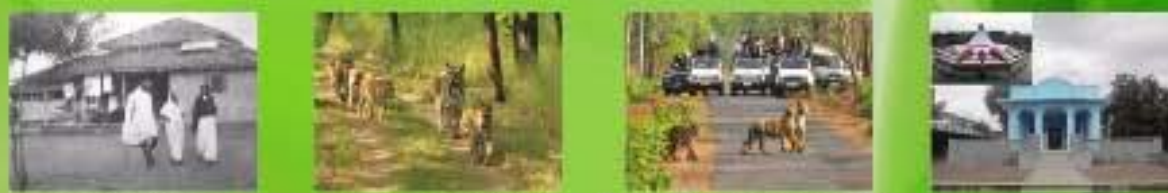
Bapu Kuti (5 km)